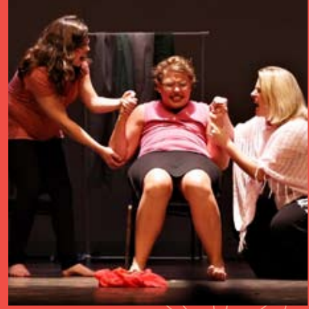
Birth around the world